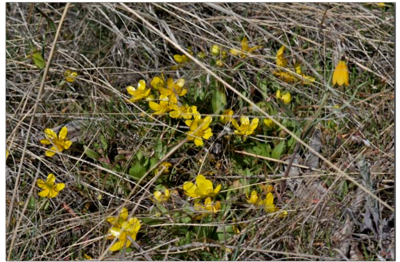
Photo Credits: Mountain Blue Birds: Heather Toles; Buttercups & Yellow Bell: Milt Stanley